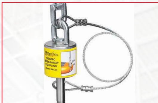
A cable tether is available for weight and flexibility support in large seismic loops.