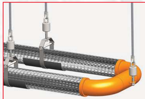
Units can also be used with saddles to prevent long flexible legs on large loops from sagging.