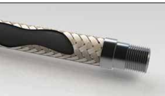
Flexible EPDM hose covered by stainless steel braid