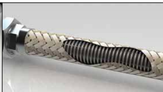
Both Extremely flexible stainless steel corrugated hose covered by stainless steel braid