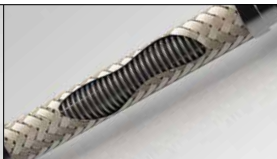
Durable Stainless steel corrugated hose covered by stainless steel braid